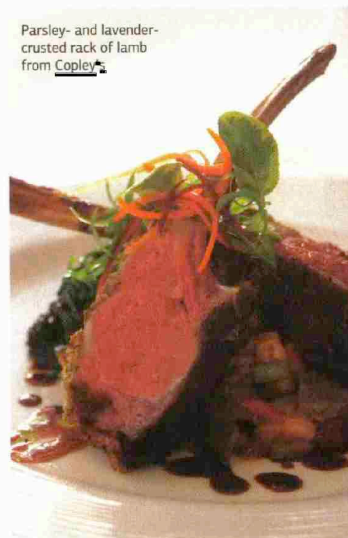
Parsley- and lavender-crusted rack of lamb from Copley's

I was fortunate to experience a taste of the upcoming Restaurant Week during a recent media preview. I stayed at the Hyatt Regency Suites Palm Springs, an exquisite location for such an event—in the heart of the old city's downtown, on North Palm Canyon Drive.